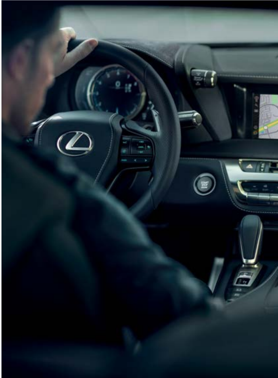
LCh shown with Black leather interior trim