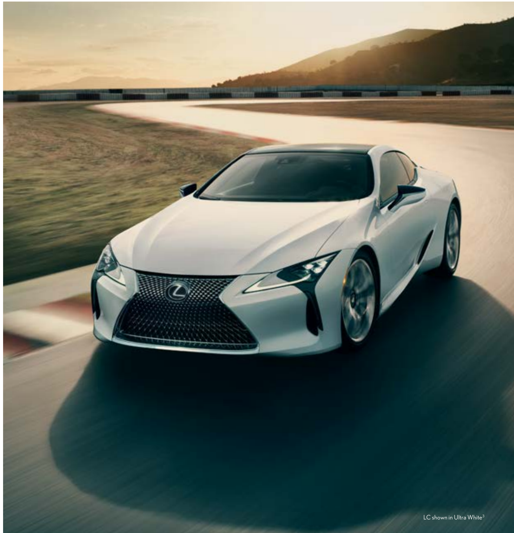
LC shown in Ultra White 3