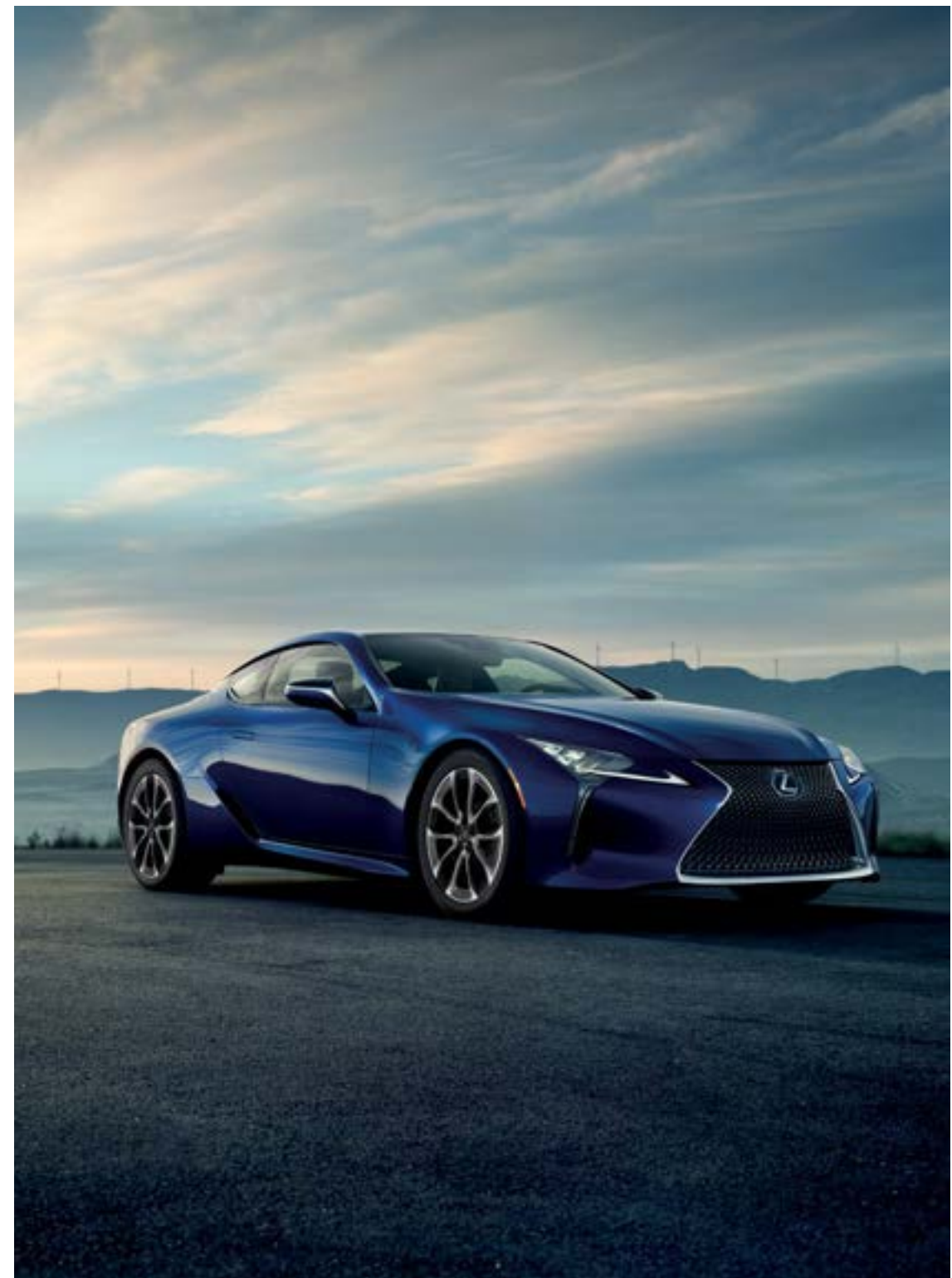
LCh shown in Nightfall Mica

From the customizable Bespoke Build coupe to the thoughtful details you'll discover in the incomparable LC Convertible, every element is designed to elicit a response from the driver.