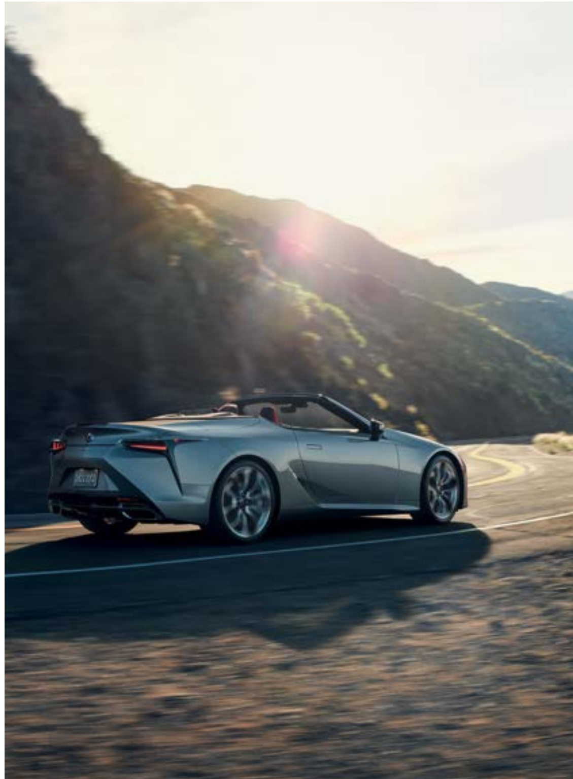
LC Convertible shown in Atomic Silver