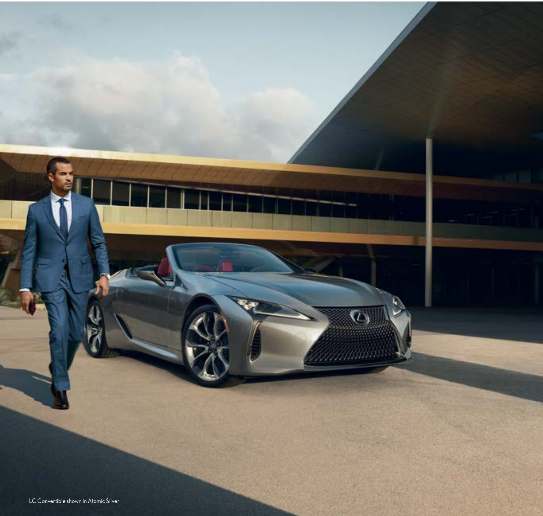
LC Convertible shown in Atomic Silver