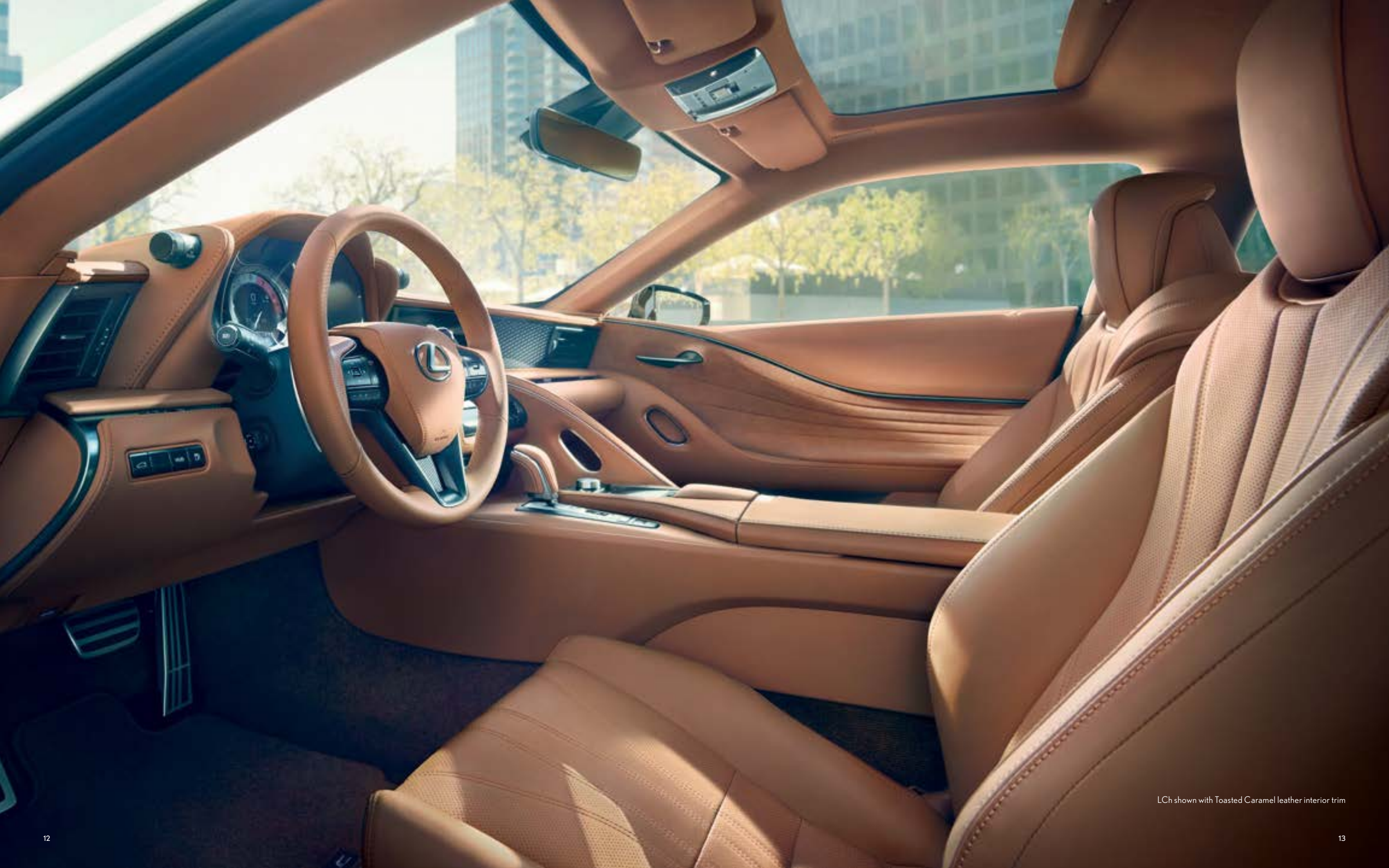
LCh shown with Toasted Caramel leather interior trim