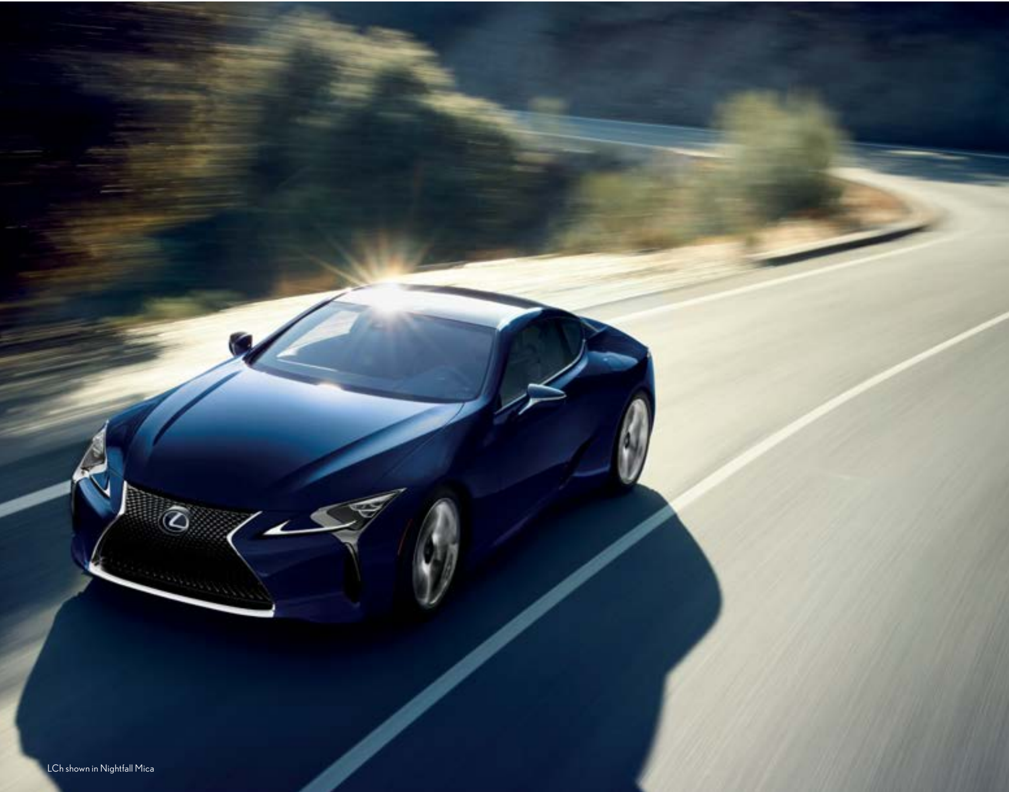
LCh shown in Nightfall Mica