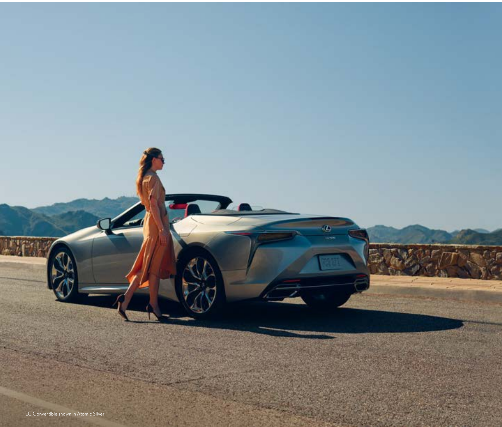
LC Convertible shown in Atomic Silver