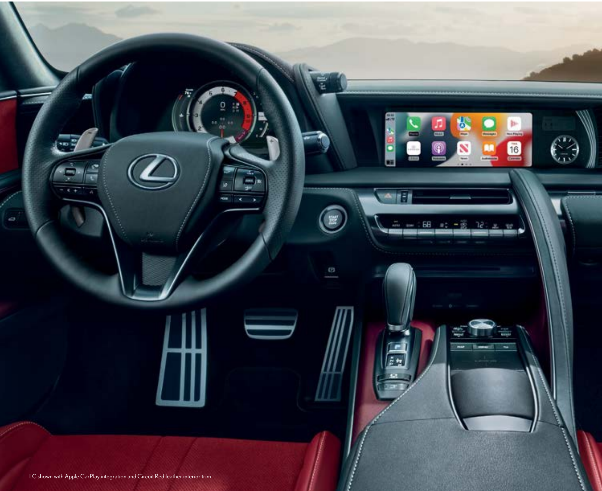
LC shown with Apple CarPlay integration and Circuit Red leather interior trim