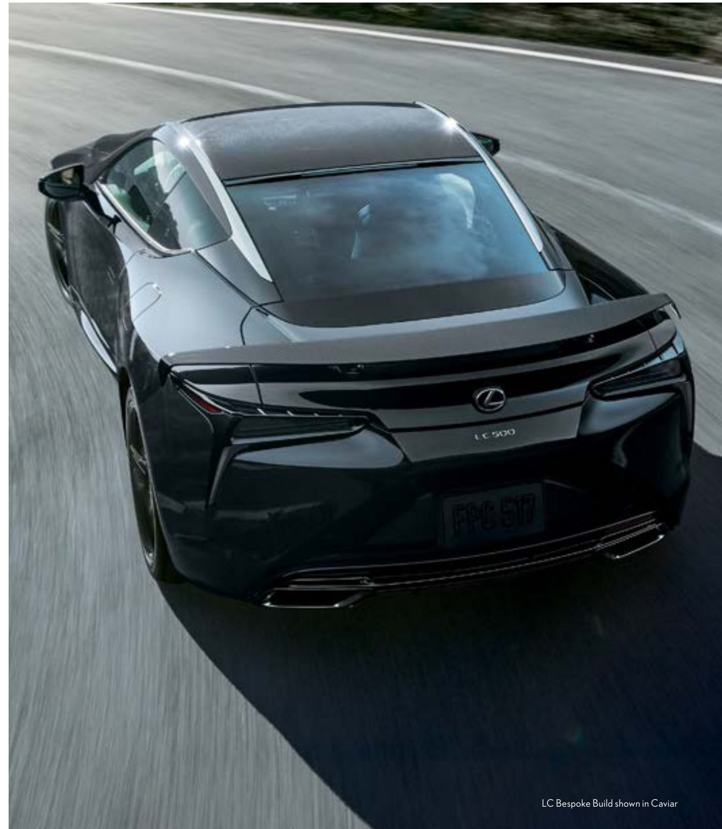
LC Bespoke Build shown in Caviar