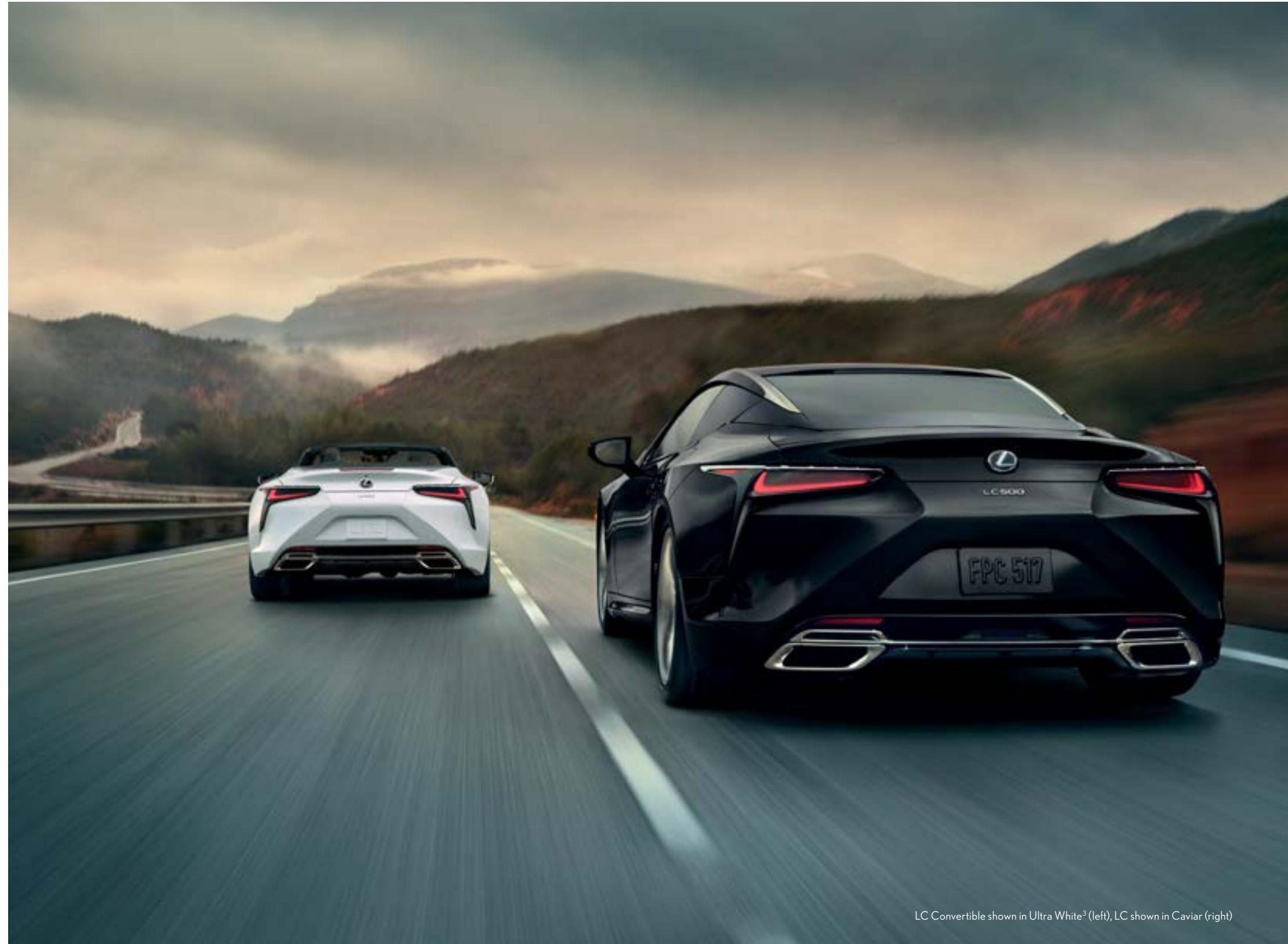
LC Convertible shown in Ultra White 3 (left), LC shown in Caviar (right)

A 10-speed Direct-Shift automatic transmission with magnesium paddle shifters was specifically designed for the LC. It changes gears in 0.12 seconds. Or, half the time it takes the average human to blink. The system also learns your habits every time you drive, selecting the optimum gear based on vehicle speed, acceleration and your driving style—even choosing the ideal gear while cornering.